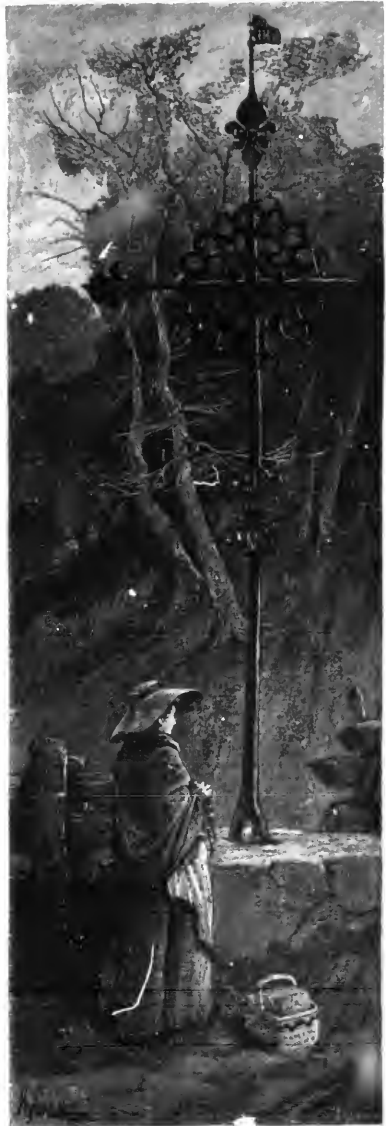
BY THE ROAD-SIDE.

But now we see the sun playing on the convent-spire of Ste. Anne; Cape Tourmente and Orleans seem to meet, and the river has the appearance of a great bay. Long ribbons of the characteristic Canadian fence run crookedly up to the crest of pines; a fringe of houses lies along the shore. And now the main-land and the island divide; the open river shows the line of the hazy shore downstream, and we are approaching the long wharf and the toll-gatherer of our Mecca. But come back with me to Quebec, and drive through the romantic hamlets of the Côte de Beauré, with its endless interest in life, char-